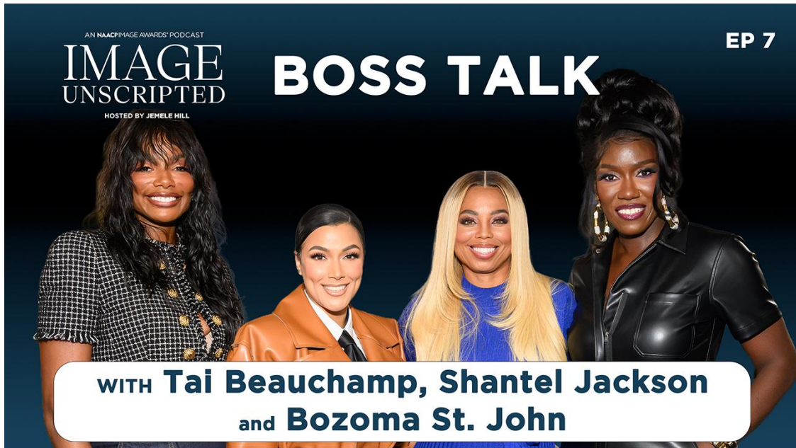
IMAGE UNSCRIPTED PODCAST

Don't miss the new Image Unscripted Podcast. Hosted by Jemele Hill , the podcast features candid conversations with stars who are shaping the culture.