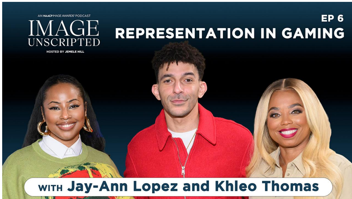
IMAGE UNSCRIPTED PODCAST

Don't miss the new Image Unscripted Podcast. Hosted by Jemele Hill , the podcast features candid conversations with stars who are shaping the culture.