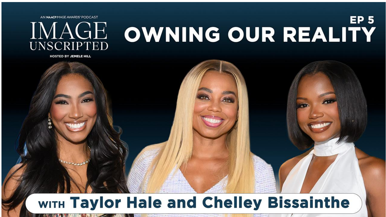
IMAGE UNSCRIPTED PODCAST

Don't miss the new Image Unscripted Podcast. Hosted by Jemele Hill , the podcast features candid conversations with stars who are shaping the culture.