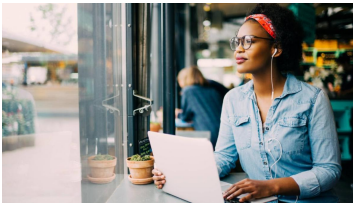
Should You Buy a Franchise?