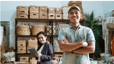
Finding Capital for Your Business